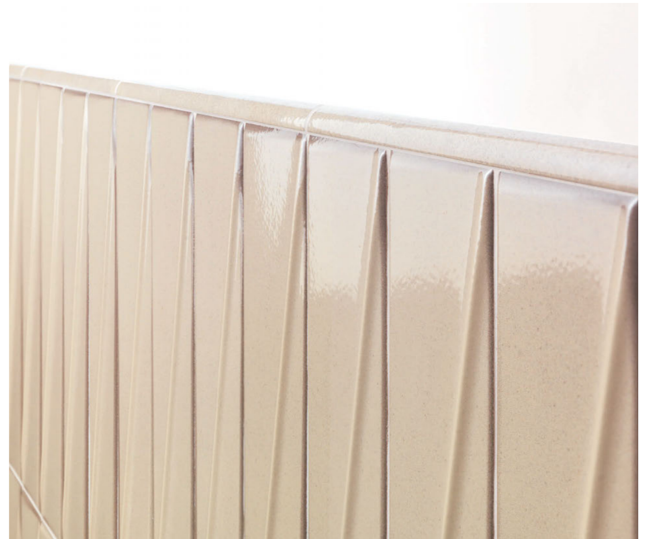
> Wall / Pulse Dune 7,6x30,5 Pulse Quarter Round Dune 1,2x30,5