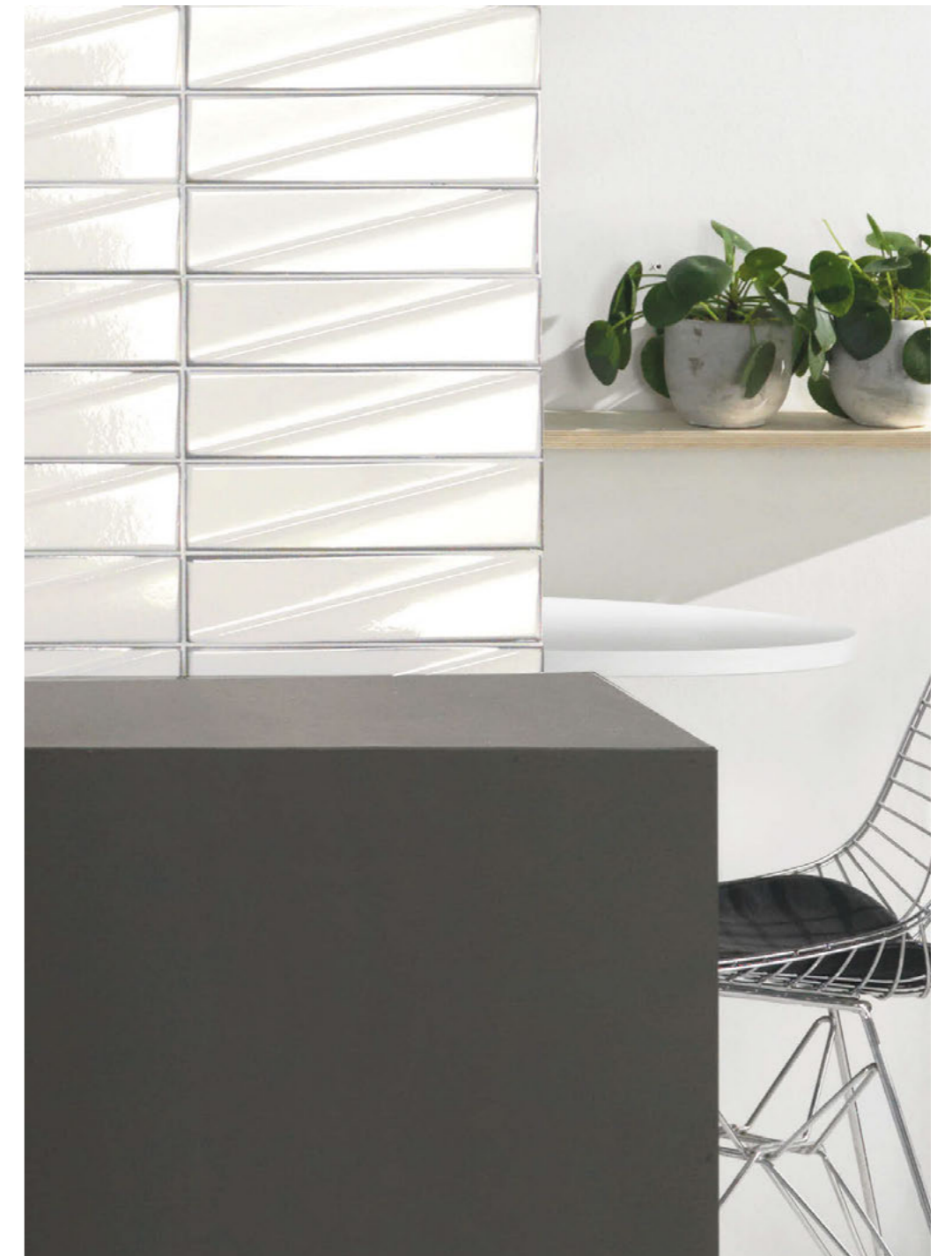
> Wall / Pulse Ice 7,6x30,5