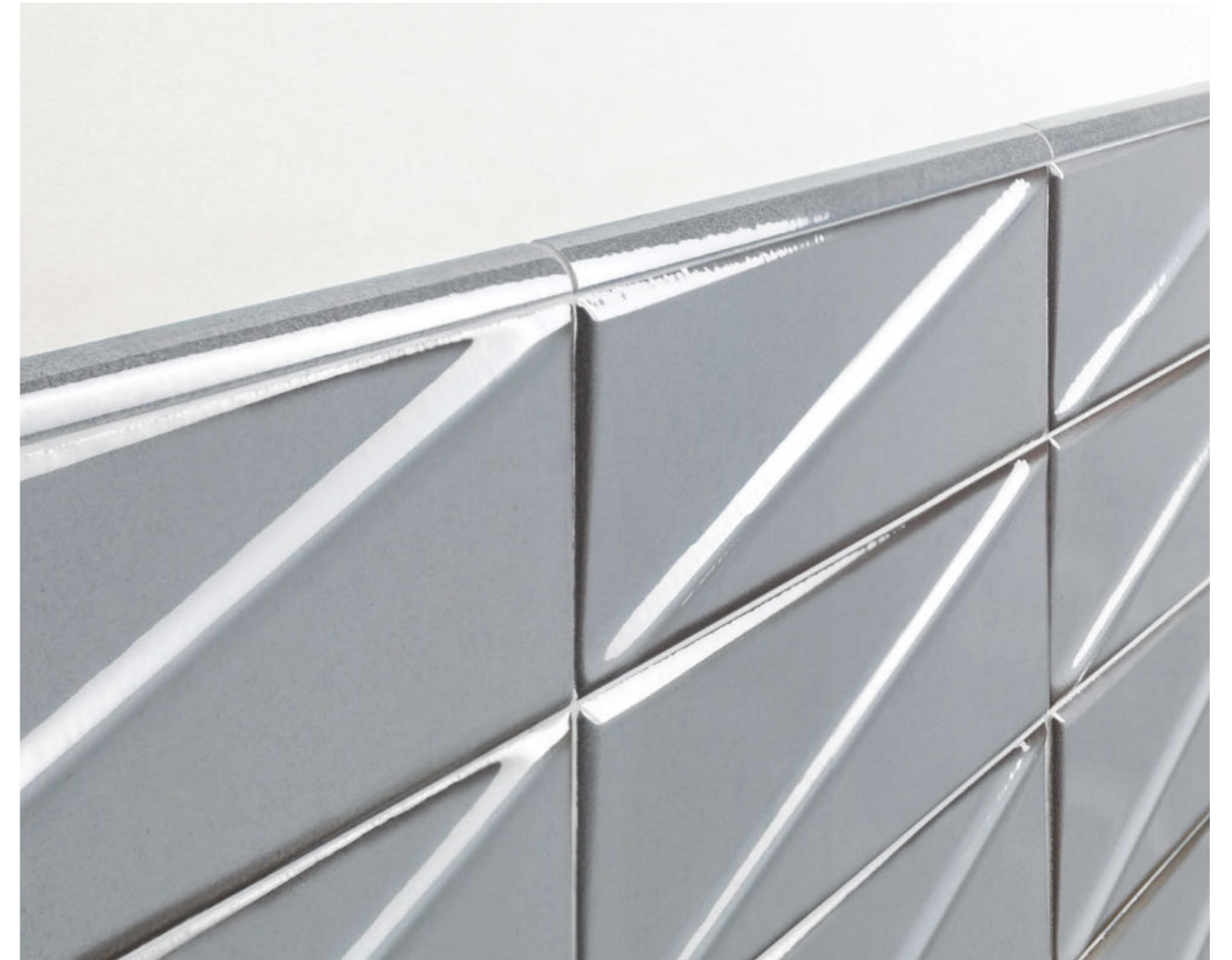
> Wall / Pulse Misty 7,6x30,5 Pulse Quarter Round Misty 1,2x30,5