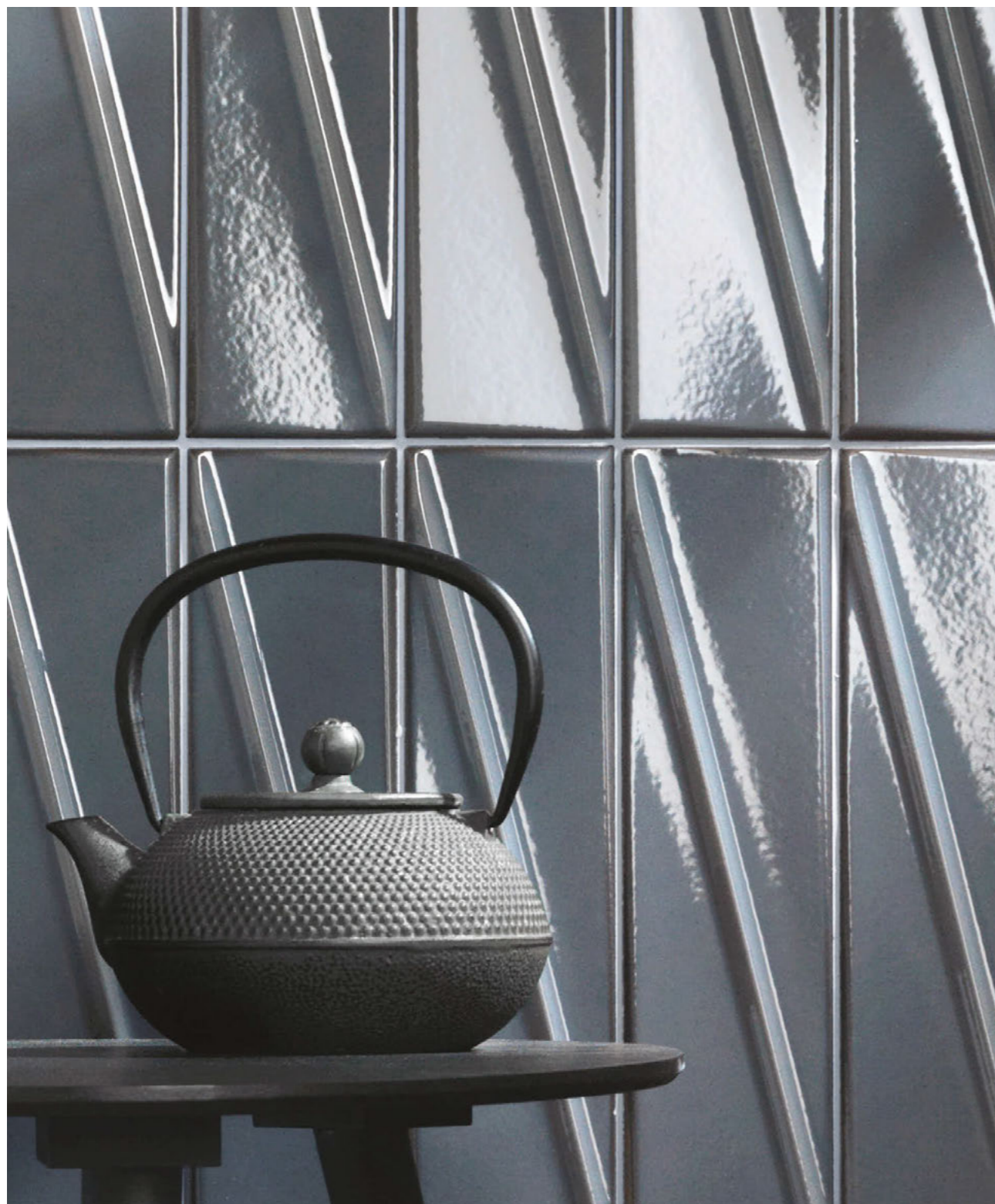
> Wall / Pulse Gray 7,6x30,5